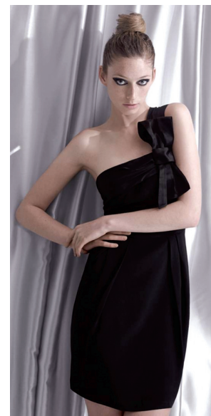
Untold asymmetric bow dress, £75, House of Fraser