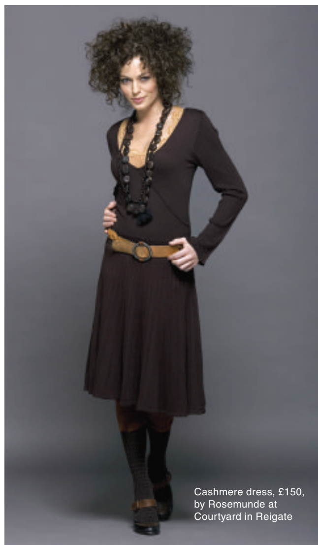
Cashmere dress, £150, by Rosemunde at Courtyard in Reigate